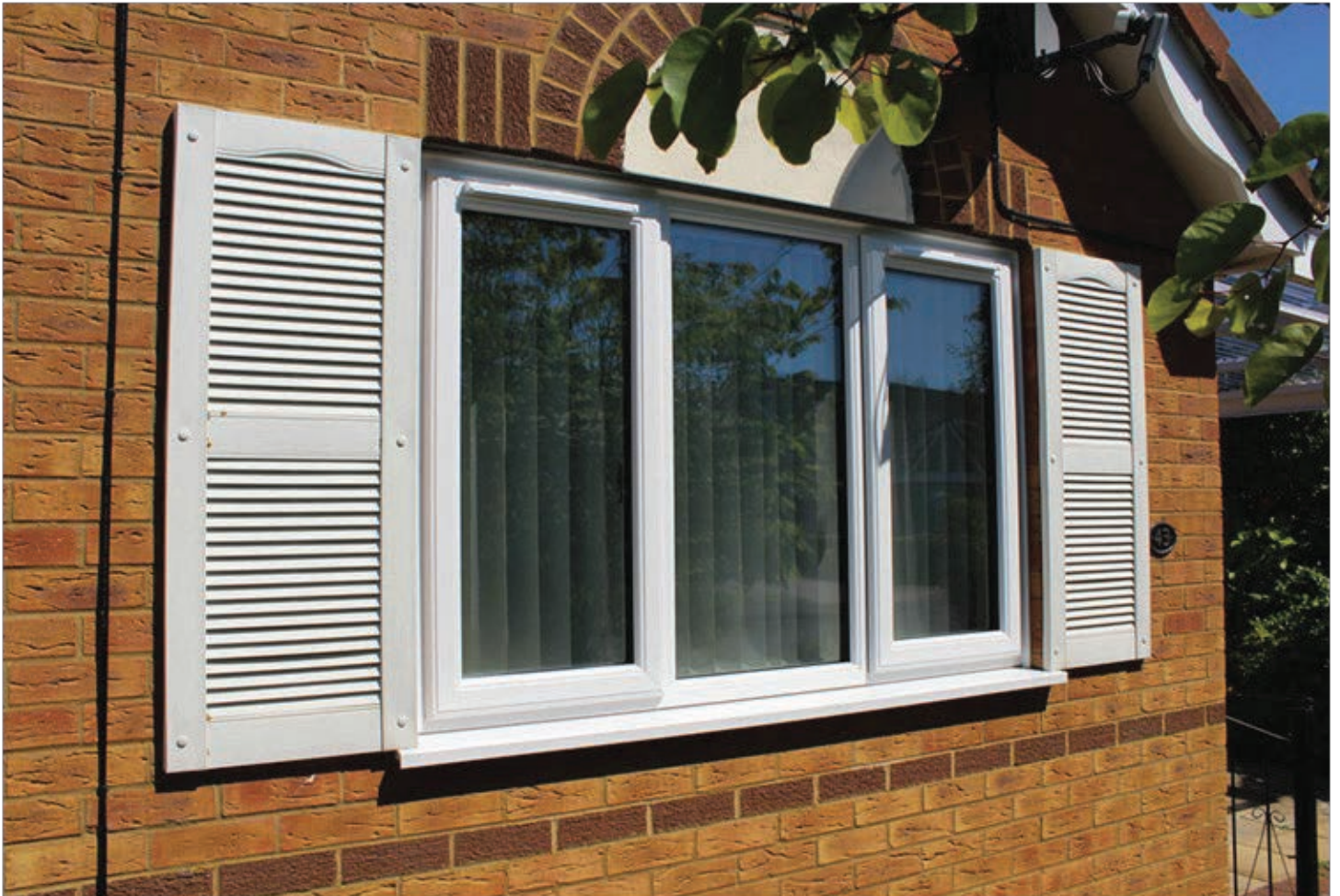
AN OPEN OUT CASEMENT UPVC WINDOW

They're the most versatile replacement window, available in a wide range of styles, colours and as such can be designed perfectly to suit most standard homes. Replacement casement windows are available in uPVC, timber or aluminium, with the option of triple glazing on uPVC.