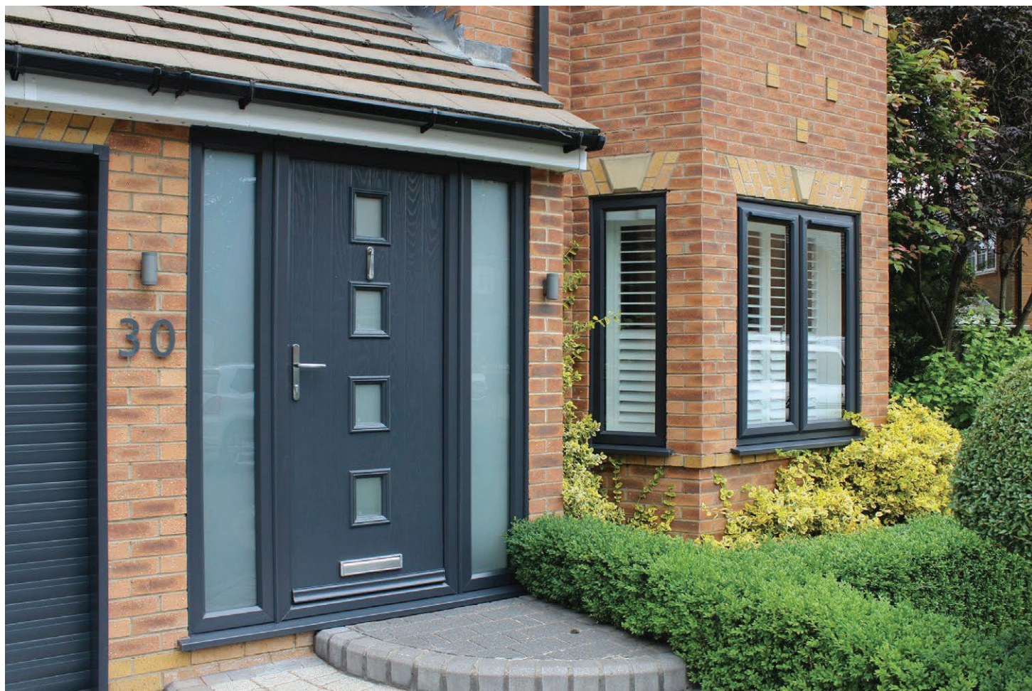
An anthracite grey coloured door and window combination

All the finishes are achieved by permanently bonding foils to the PVC-U. They won't fade, peel or split and will never need painting to maintain their stunning looks. There's no need to have the same colours indoors and out. You can have white indoors, coloured outdoors, or vice versa. You can have two different colours, or two different woodgrain effects. It's about making the choice that suits your home, your décor and your taste.