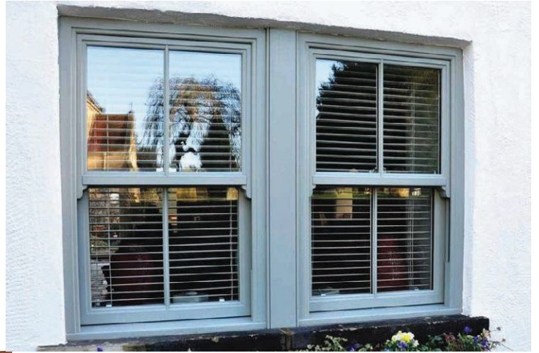
OUTSIDE VIEW OF COLOURED SASH WINDOW

The authentic period design and smooth running mechanism makes sash replacement windows the perfect choice for conservation areas and period homes that need to retain a traditional look - available in uPVC or wood and come fitted with double glazing.