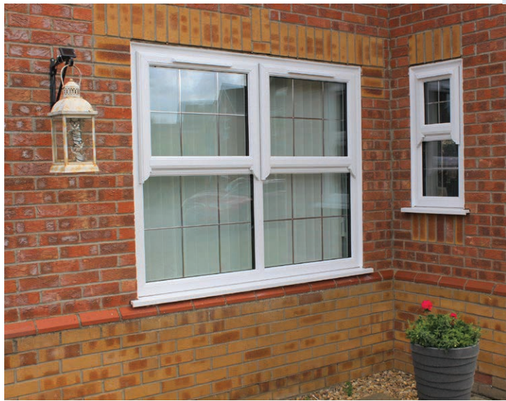
MOCK SLIDING SASH WINDOWS

Mock sash windows, designed to look like traditional sash windows with a different opening action, usually feature a fixed pane and a movable panel which tilts open like a standard casement window.